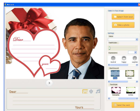
Figure 1. System Interface of the WeCard.