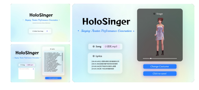
Figure 3: User Interface

Text modality model shares basically the same structure with music modality. With limited labeled semantic motions, we firstly trained the model's text branch on BABEL [3] (a large annotated action dataset), then fine-tuned it with finely labeled fragments.